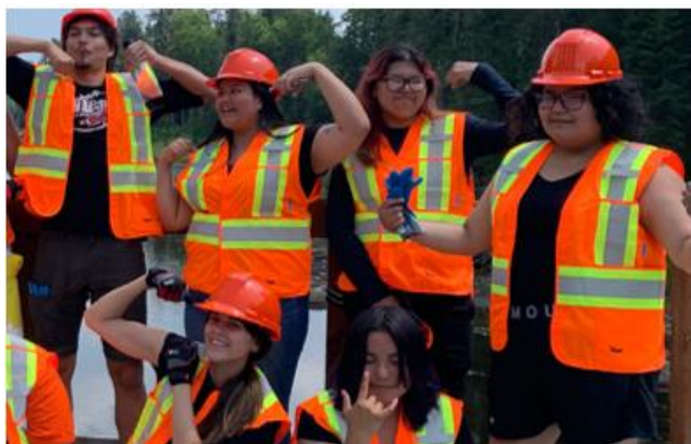
Indigenous Youth, OYEP Manitoba

The commitment by Dexterra toward community engagement & Indigenous relations is demonstrated by the policies, programs, and resources in place. In 2023, Dexterra formed the Indigenous Education & Engagement Committee acknowledging our growing Indigenous employee population and our commitment to reconciliation. Dexterra also has a corporate Indigenous Relations Policy and Guiding Principles and a dedicated Indigenous and Community Relations team lead by a Director, Community and Indigenous Relations.