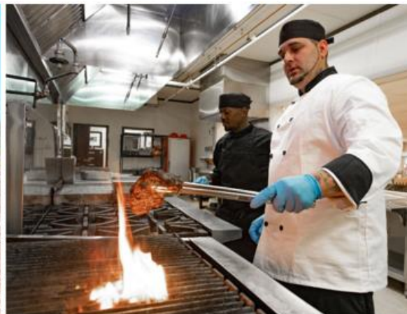
Camp Catering and Operations