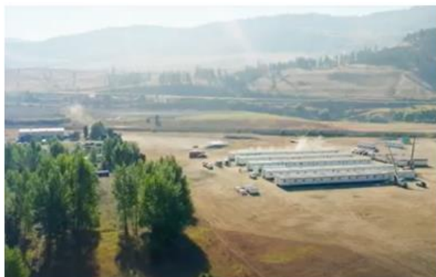
Kamloops Evacuation Camp

Workforce Accommodations and Forestry services employed an average workforce of 3,327 people in 2023 and the headcount at the end of 2023 was 2,664.