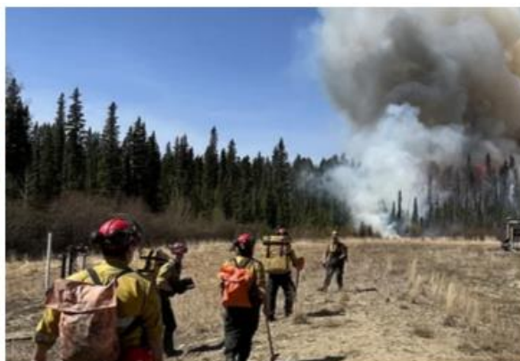
Edson, Alberta Wildfire Response