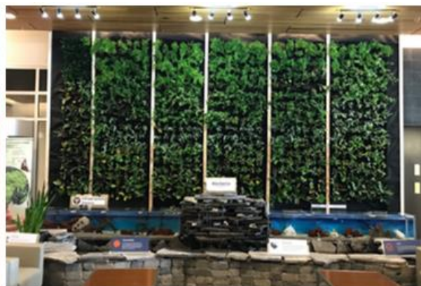
Living Wall at FSCC, Ontario

More information on Dexterra's ESG activities can be found in the 2024 ESG report, available at the Corporation's website ( dexterra.com ).