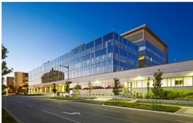
Forensics Services and Coroner's Complex, Toronto, Ontario

IFM employed an average workforce of 4,987 people in 2023 and the headcount at the end of 2023 was 5,137.