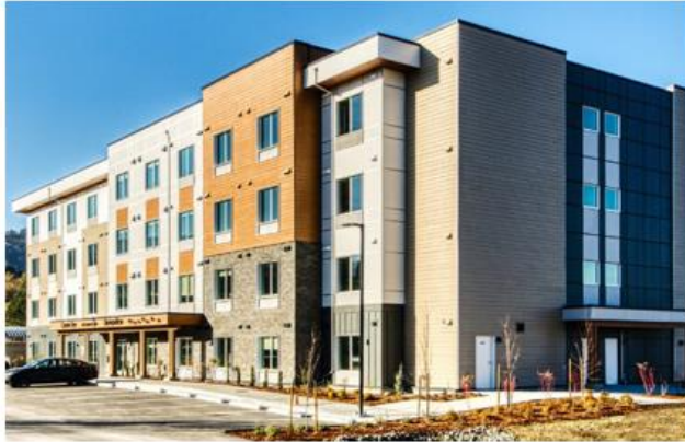
Thompson River University, British Columbia