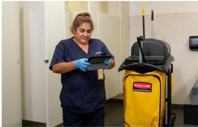
People and Organization Solutions