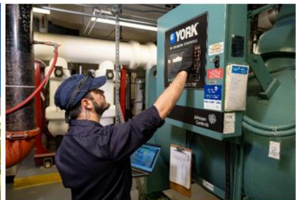
Space and Infrastructure Solutions