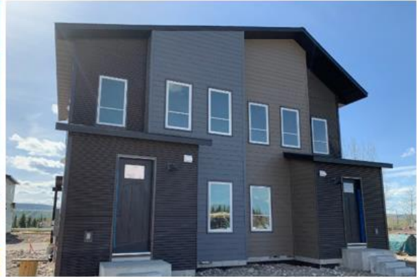
Lone Mountain Affordable Housing, Montana, USA