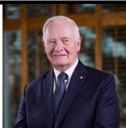
David Johnston Age: 82 Ottawa, ON, Canada Director Since May 2020 Independent (1)

The Right Honourable David Johnston, C.C. has been a director of Dexterra since May 29, 2020. Mr. Johnston has held several distinguished management and leadership positions in academia and government, including acting as the 28th Governor General of Canada from 2010 to 2017. In 2018, Mr. Johnston was appointed Colonel to the Royal Canadian Regiment. Prior to his installation as governor general, Mr. Johnston was a professor of law for 45 years and served as president and vice-chancellor of the University of Waterloo for two terms and principal and vice-chancellor of McGill University for 15 years. Mr. Johnston has also served on numerous provincial and federal task forces and committees, acted as president of the Association of Universities and Colleges of Canada (now Universities Canada) and of the Conférence des recteurs et des principaux des universités du Québec. Mr. Johnston is a member of the Order of Canada and was promoted to companion, the Order's highest level, in 1997. Mr. Johnston was also the first non-U.S. citizen to be elected chair of Harvard University's board of overseers. Mr. Johnston holds degrees from Harvard, Cambridge and Queens and has received more than three dozen honorary degrees or fellowships.